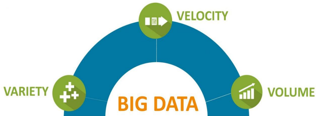
Figure 1: Three Vs of Big Data Described by Yu and Wang (2022).